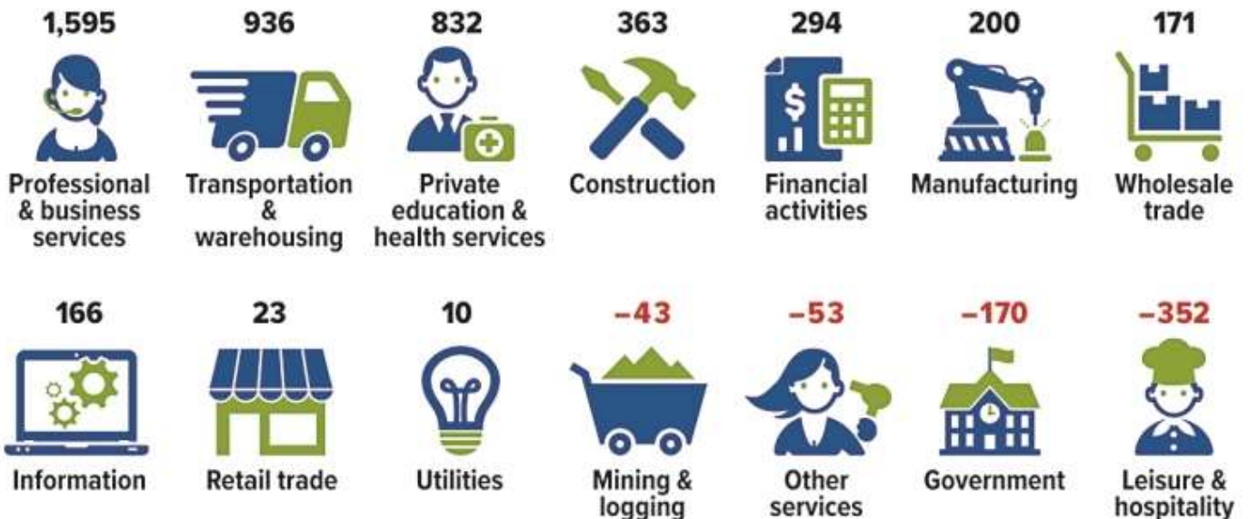
Change in U.S. employment by industry between February 2020 and July 2023, in thousands