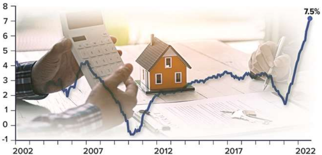
12-month change in shelter costs (CPI-U)